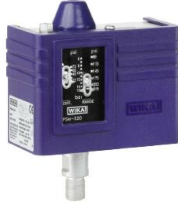
Pressure switch, heavy-duty version, model PSM-520